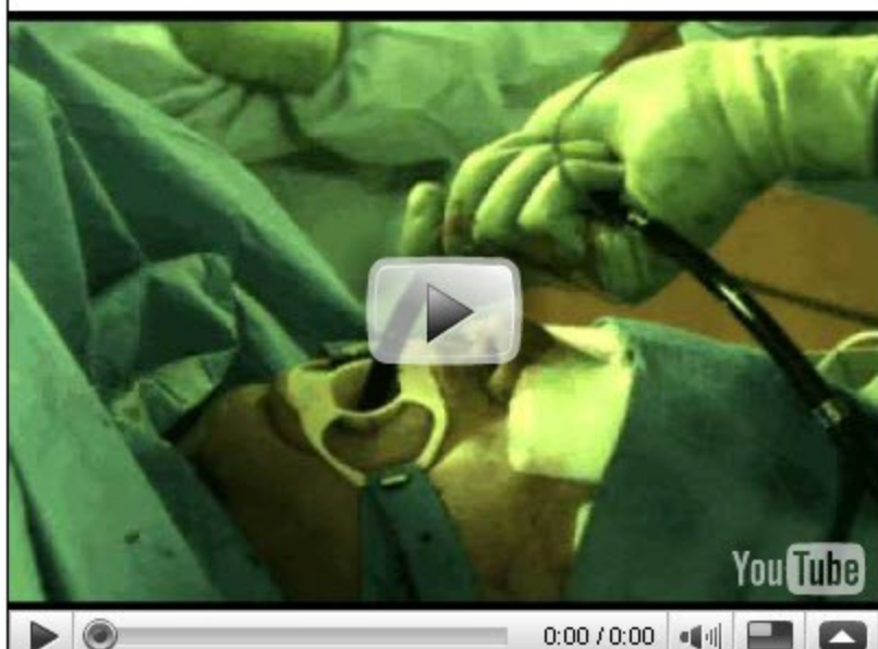
Video: Courtesy of Northwestern Memorial Hospital